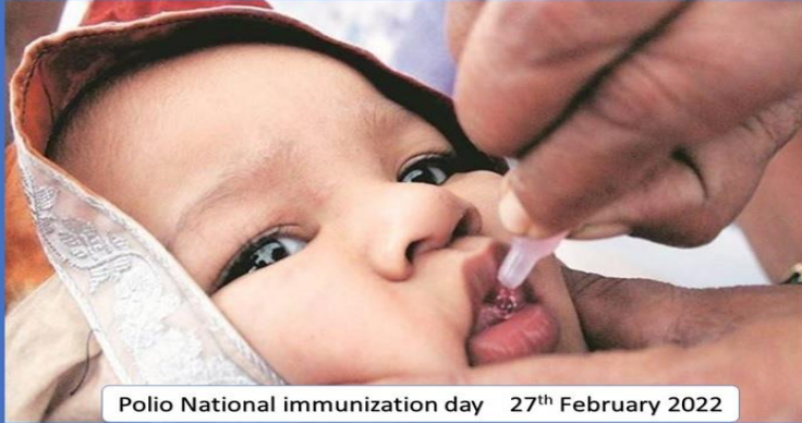
Polio National immunization day 27 th February 2022

दो बूंद पोलियो पिलाओ बच्चे की जिंदगी खुशहाल बनाओ