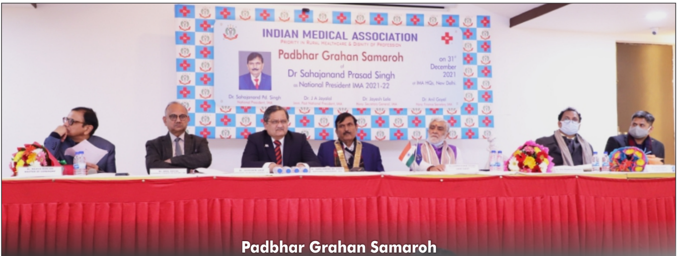
Padbhar Grahana Samaroh