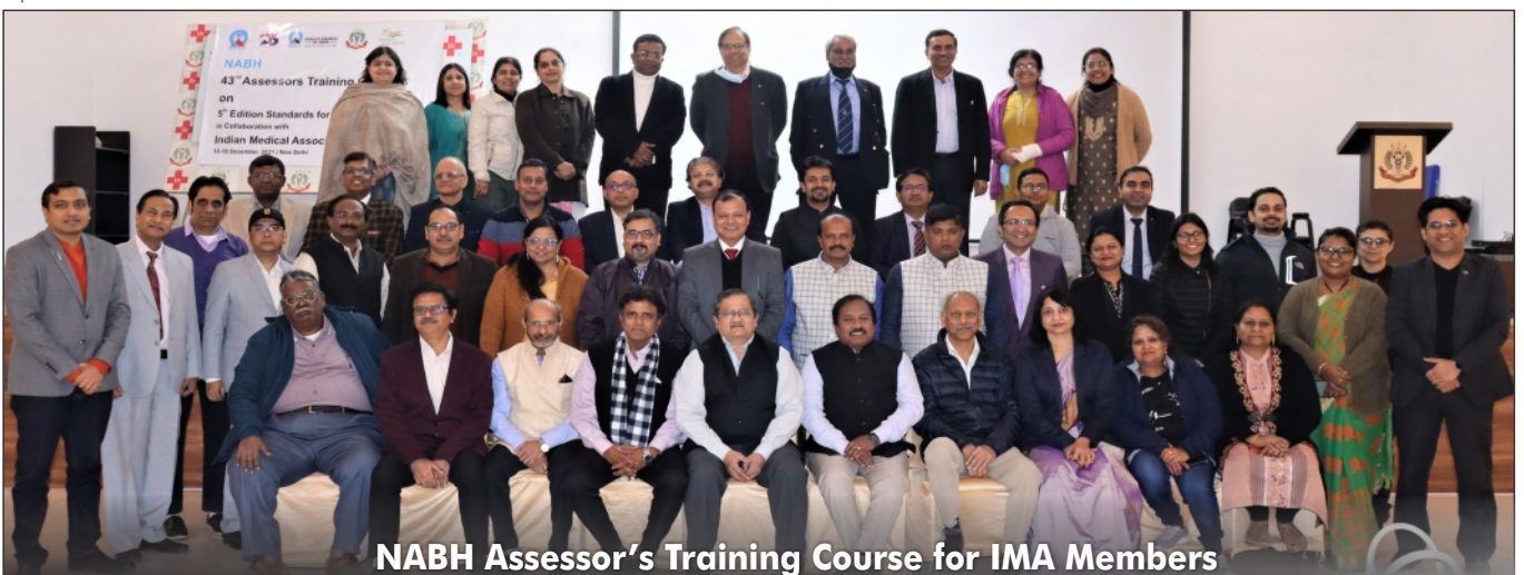
NABH Assessor's Training Course for IMA Members