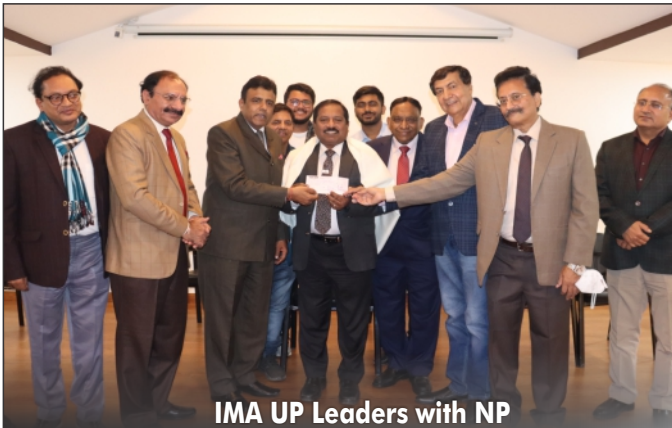
IMA UP Leaders with NP