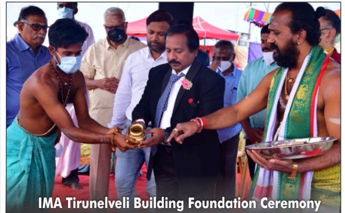
IMA Tirunelveli Building Foundation Ceremony