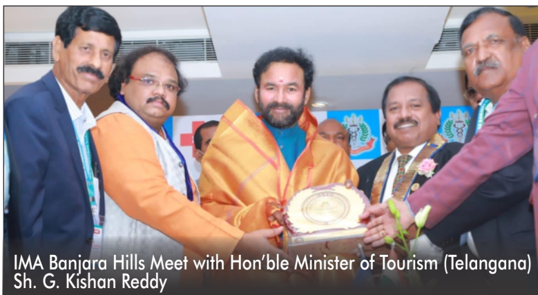
IMA Banjara Hills Meet with Hon'ble Minister of Tourism (Telangana) Sh. G. Kishan Reddy