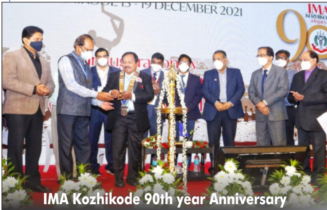
IMA Kozhikode 90th year Anniversary