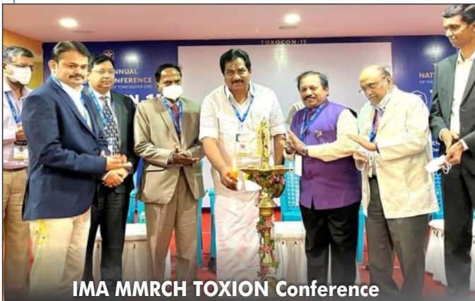
IMA MMRCH TOXION Conference