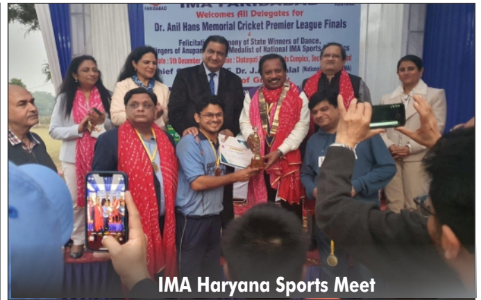
IMA Haryana Sports Meet