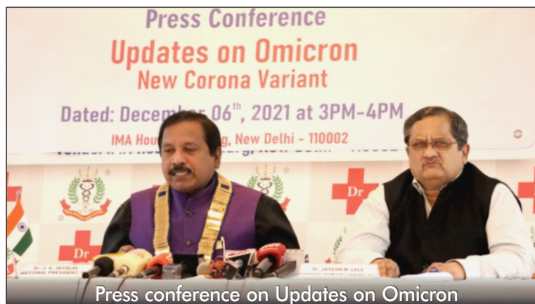
Press conference on Updates on Omicron