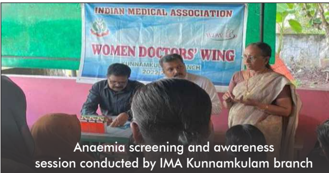
Anaemia screening and awareness session conducted by IMA Kunnamkulam branch