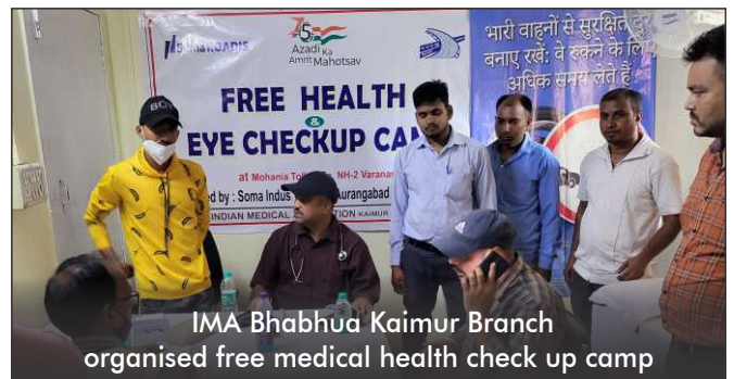
IMA Bhabhua Kaimur Branch organised free medical health check up camp