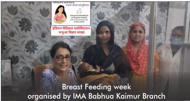
Breast Feeding week organised by IMA Babhua Kaimur Branch