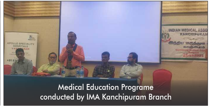
Medical Education Programme conducted by IMA Kanchipuram Branch