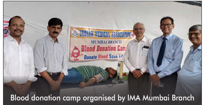
Blood donation camp organised by IMA Mumbai Branch