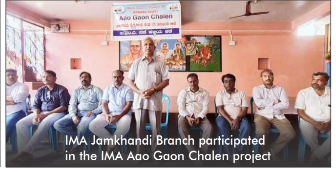
IMA Jamkhandi Branch participated in the IMA Aao Gaon Chalen project