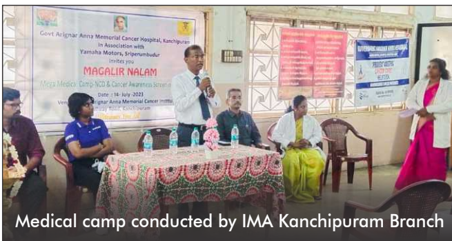
Medical camp conducted by IMA Kanchipuram Branch