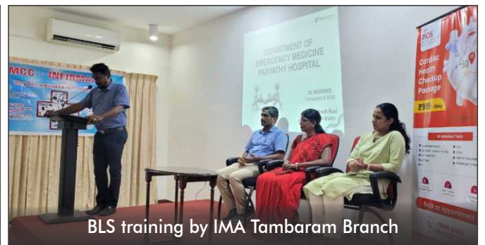
BLS training by IMA Tambaram Branch