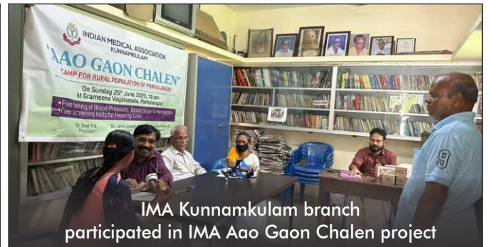
IMA Kunnamkulam branch participated in IMA Aao Gaon Chalen project