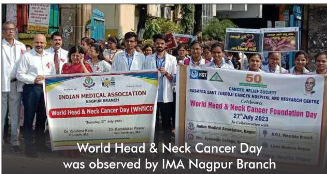
World Head & Neck Cancer Day was observed by IMA Nagpur Branch