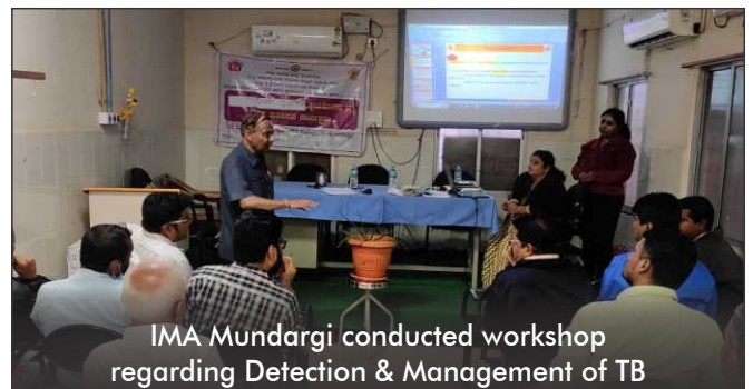
IMA Mundargi conducted workshop regarding Detection & Management of TB