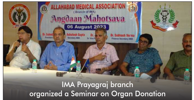
IMA Prayagraj branch organized a Seminar on Organ Donation