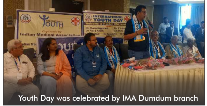
Youth Day was celebrated by IMA Dumdum branch