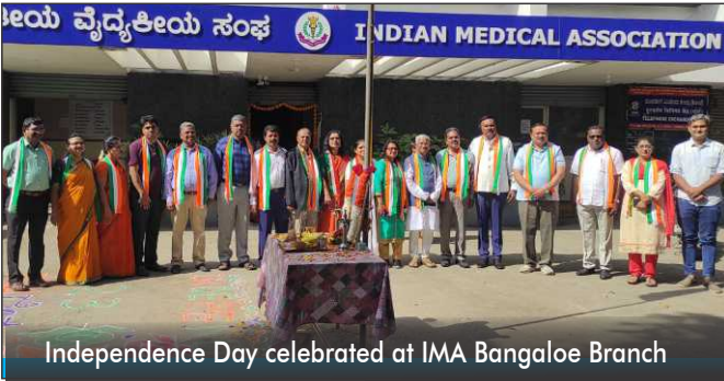
Independence Day celebrated at IMA Bangaloe Branch