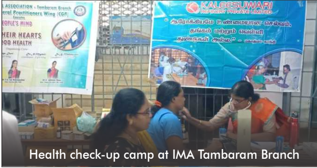
Health check-up camp at IMA Tambaram Branch