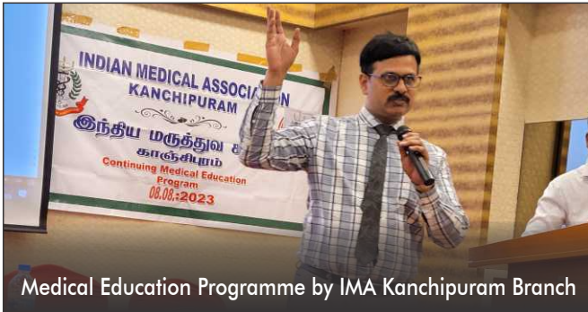
Medical Education Programme by IMA Kanchipuram Branch