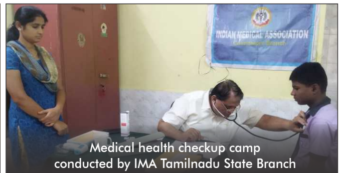
Medical health checkup camp conducted by IMA Tamilnadu State Branch