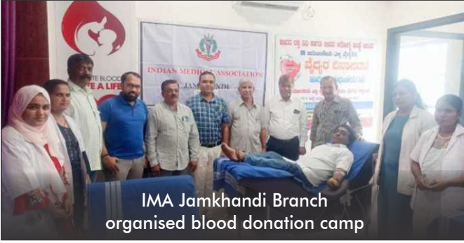
IMA Jamkhandi Branch organised blood donation camp