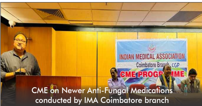
CME on Newer Anti-Fungal Medications conducted by IMA Coimbatore branch