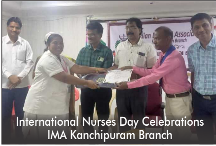
International Nurses Day Celebrations IMA Kanchipuram Branch