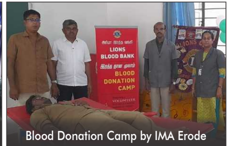
Blood Donation Camp by IMA Erode