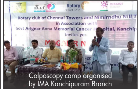
Colposcopy camp organised by IMA Kanchipuram Branch