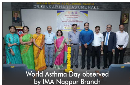
World Asthma Day observed by IMA Nagpur Branch