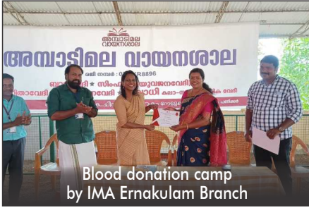
Blood donation camp by IMA Ernakulam Branch