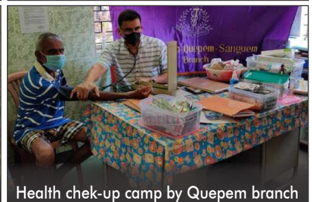
Health check-up camp by Quepem branch