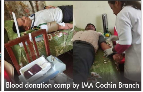
Blood donation camp by IMA Cochin Branch