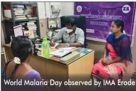
World Malaria Day observed by IMA Erode