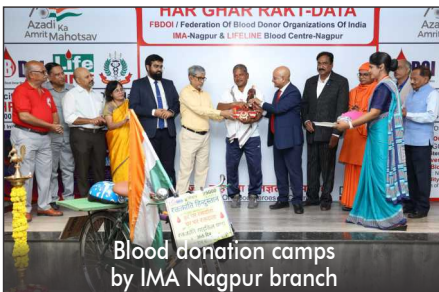
Blood donation camps by IMA Nagpur branch