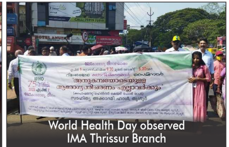
World Health Day observed IMA Thirssur Branch