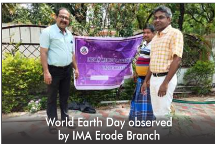
World Earth Day observed by IMA Erode Branch