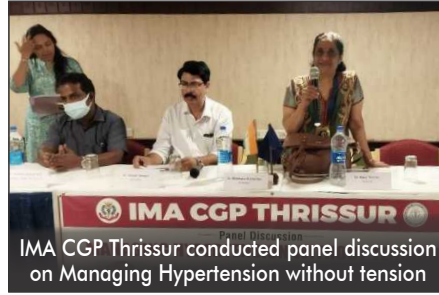
IMA CGP Thirssur conducted panel discussion on Managing Hypertension without tension