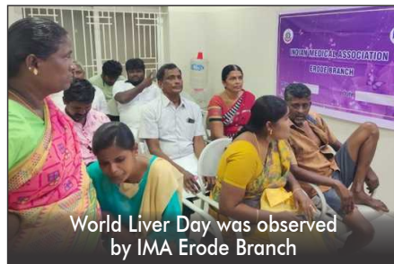
World Liver Day was observed by IMA Erode Branch