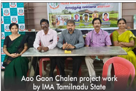
Aao Gaon Chalen project work by IMA Tamilnadu State