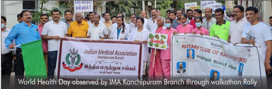
World Health Day observed by IMA Kanchipuram Branch through walkathon Rally