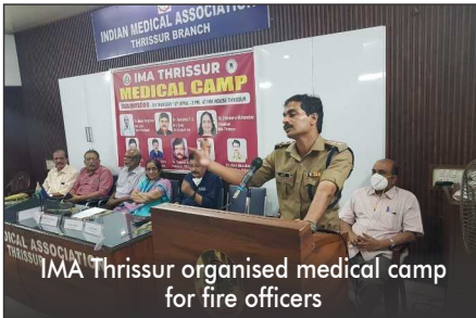
IMA Thirssur organised medical camp for fire officers