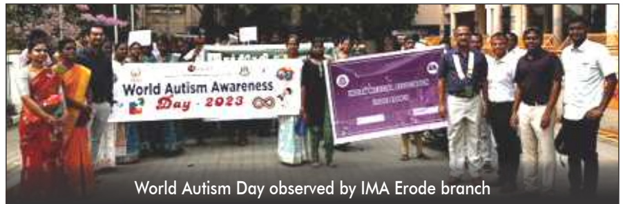
World Autism Awareness Day - 2023 observed by IMA Erode branch