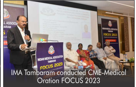
IMA Tambaram conducted CME-Medical Oration FOCUS 2023