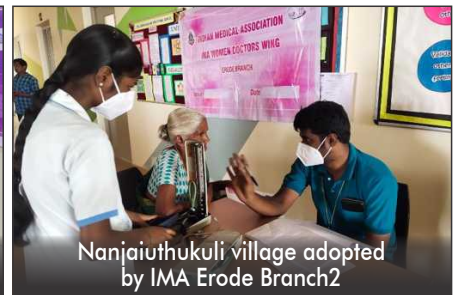
Nanjaiuthukuli village adopted by IMA Erode Branch2