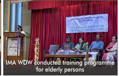
IMA WDW conducted training programme for elderly persons