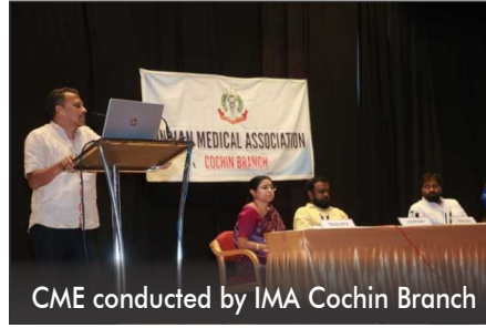
CME conducted by IMA Cochin Branch