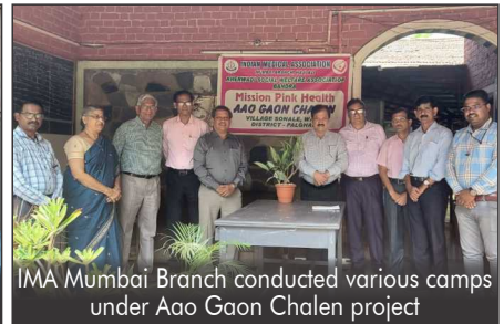
IMA Mumbai Branch conducted various camps under Aao Gaon Chalen project