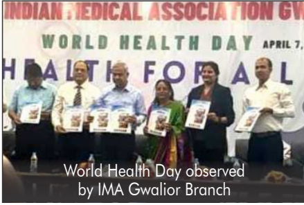
World Health Day observed by IMA Gwalior Branch