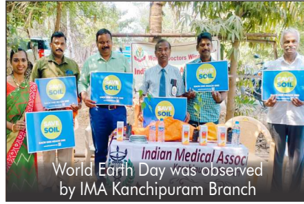
World Earth Day was observed by IMA Kanchipuram Branch