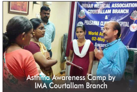
Asthma Awareness Camp by IMA Courtallam Branch