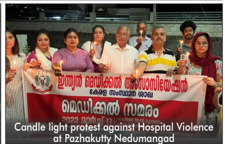
Candle light protest against Hospital Violence at Pazhakkuty Nedumangad