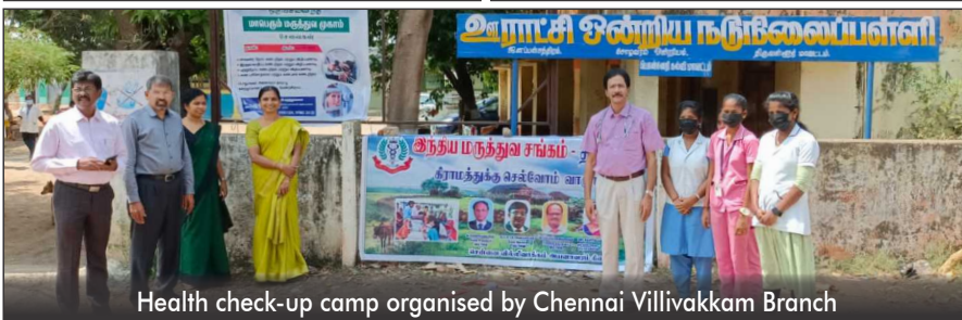
Health check-up camp organised by Chennai Villivakkam Branch