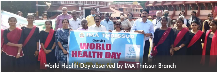
World Health Day observed by IMA Thirssur Branch