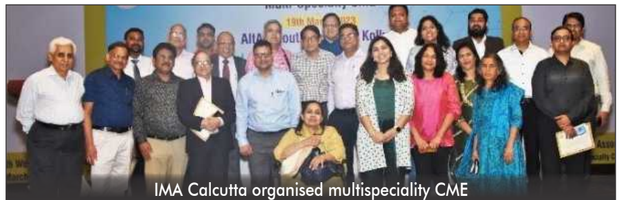
IMA Calcutta organised multispeciality CME