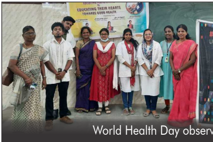
World Health Day observed by IMA Thrissur Branch