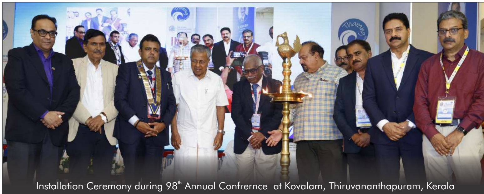
Installation Ceremony during 98 th Annual Conference at Kovalam, Thiruvananthapuram, Kerala