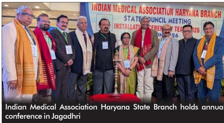
Indian Medical Association Haryana State Branch holds annual conference in Jagadhri